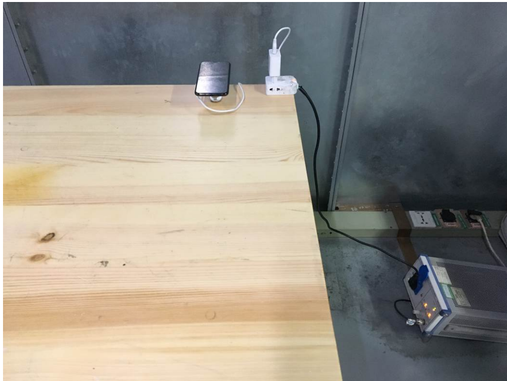
Test Setup Photo of Power Line Conducted Emissions Measurement