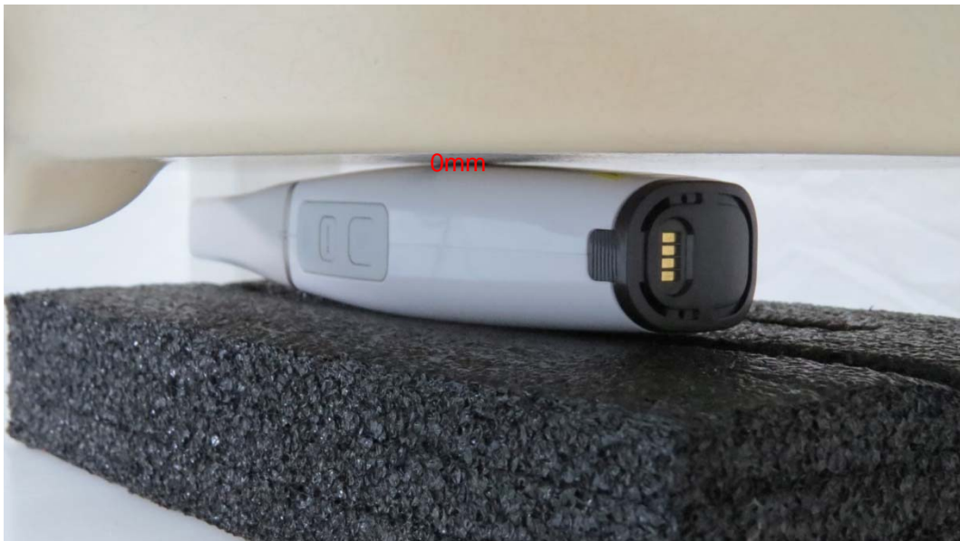
Picture 4: Right Side, the distance from handset to the bottom of the Phantom is 0mm