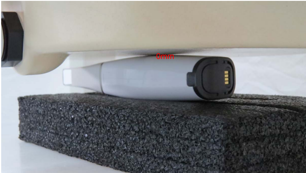
Picture 3: Left Side, the distance from handset to the bottom of the Phantom is 0mm