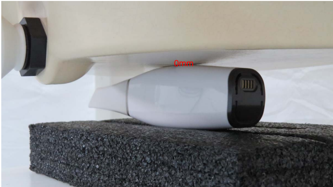
Picture 2: Front Side, the distance from handset to the bottom of the Phantom is 0mm