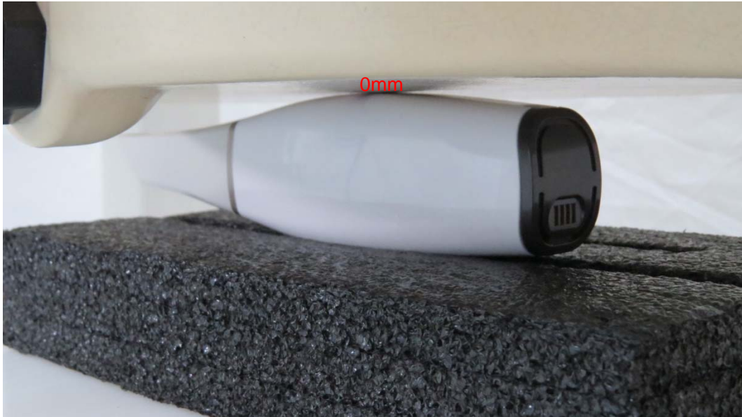
Picture 1: Back Side, the distance from handset to the bottom of the Phantom is 0mm