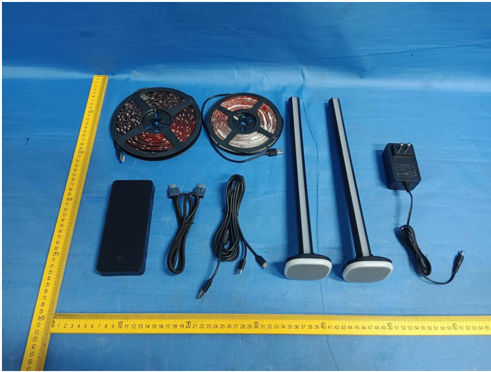
TOP VIEW OF EUT