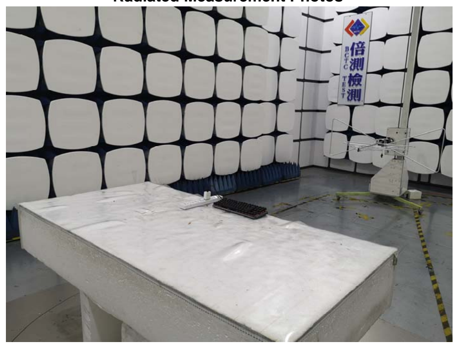
Radiated Measurement Photos