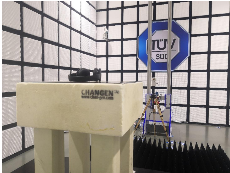
Spurious radiated above 18GHz