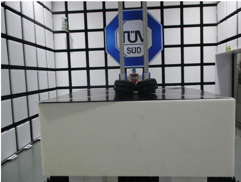
Spurious radiated 1GHz-18GHz