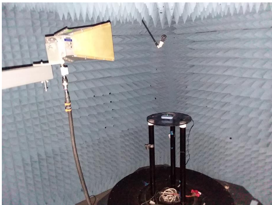
Photograph 3. Radiated Emissions, Setup Above 1GHz