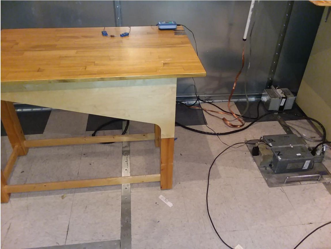
Photograph 1. Conducted Emissions, 15.207(a), Test Setup