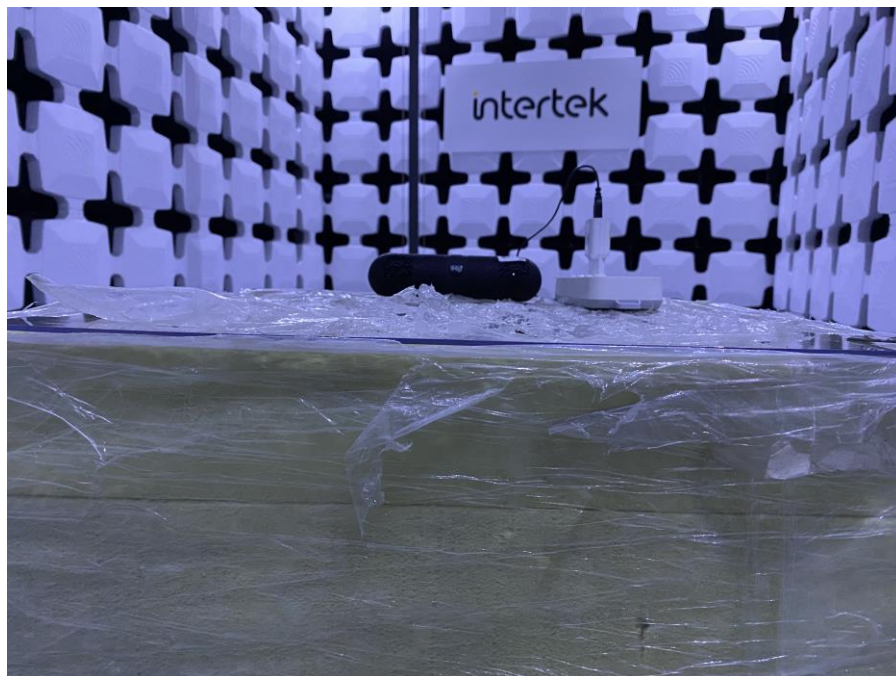
Back View (Above 1GHz)