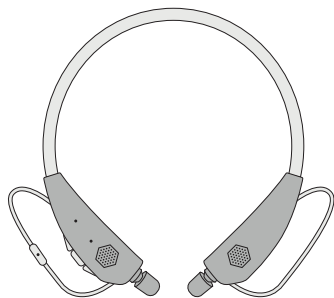
Procomm2 Bluetooth Earbuds