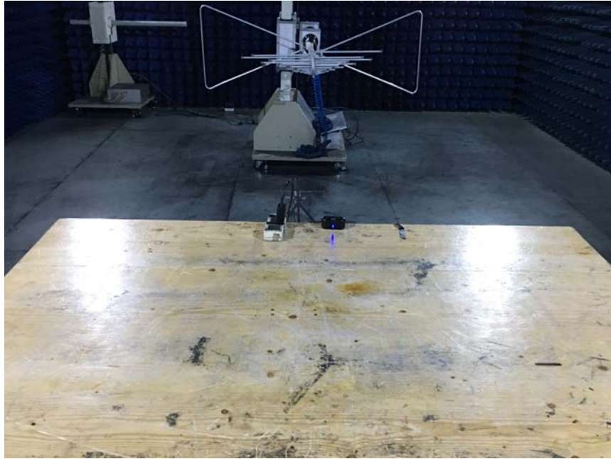
Photograph of set-up for Radiated Emission below 1GHz