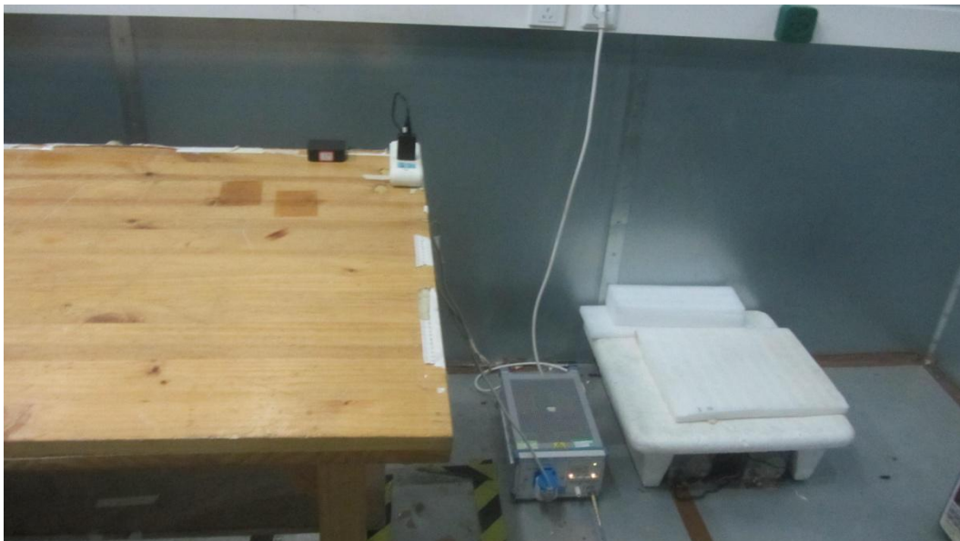
Picture 3 Conducted Emission Test Setup