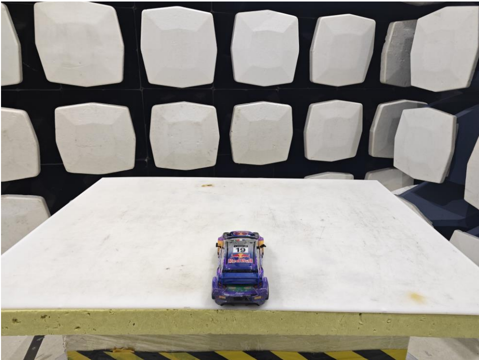
Up to 1GHz (EUT was placed in the centre of the turntable)