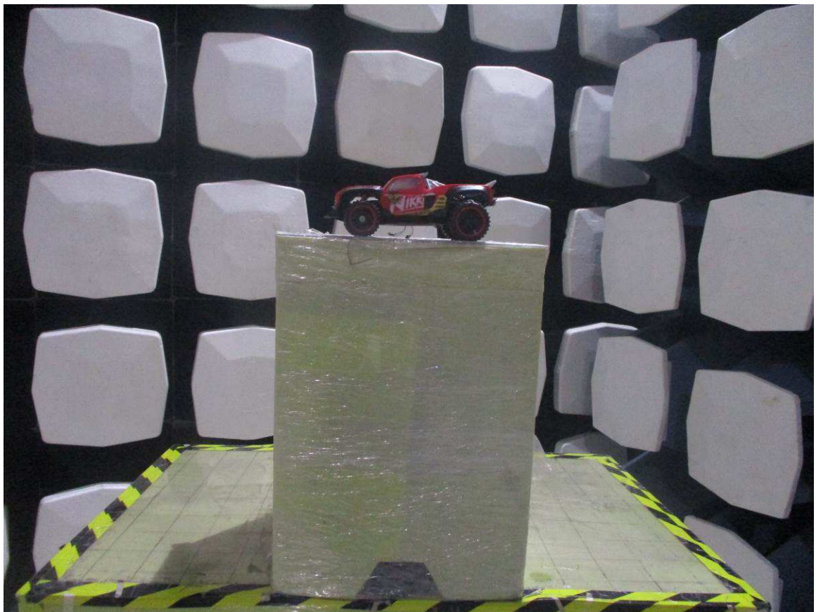
Above 1GHz (The EUT placed at the center of the turntable)