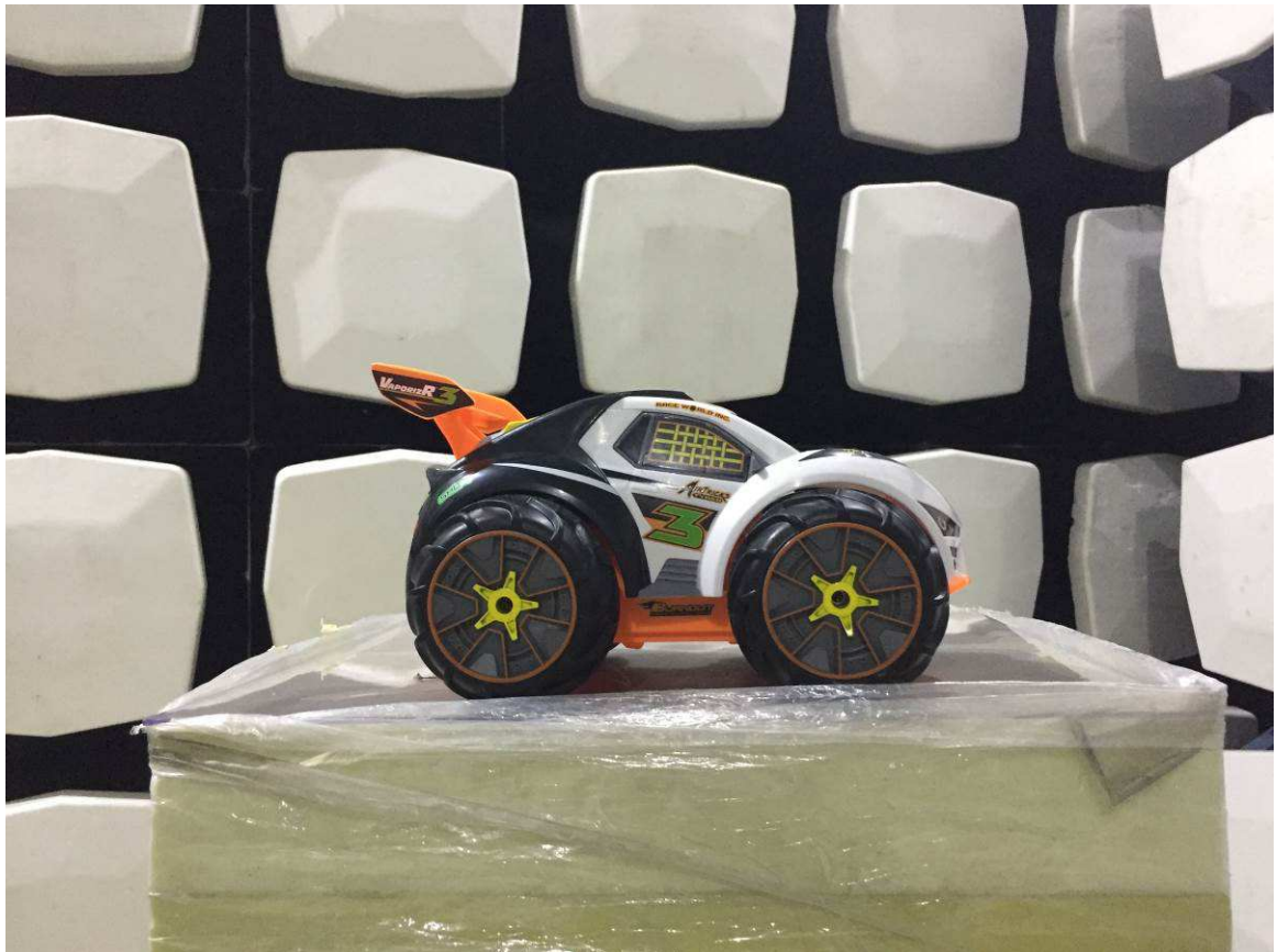
Above 1GHz (The EUT placed at the center of the turntable)