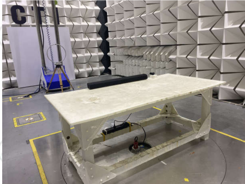
Radiated spurious emission Test Setup-1 (Below 30M)