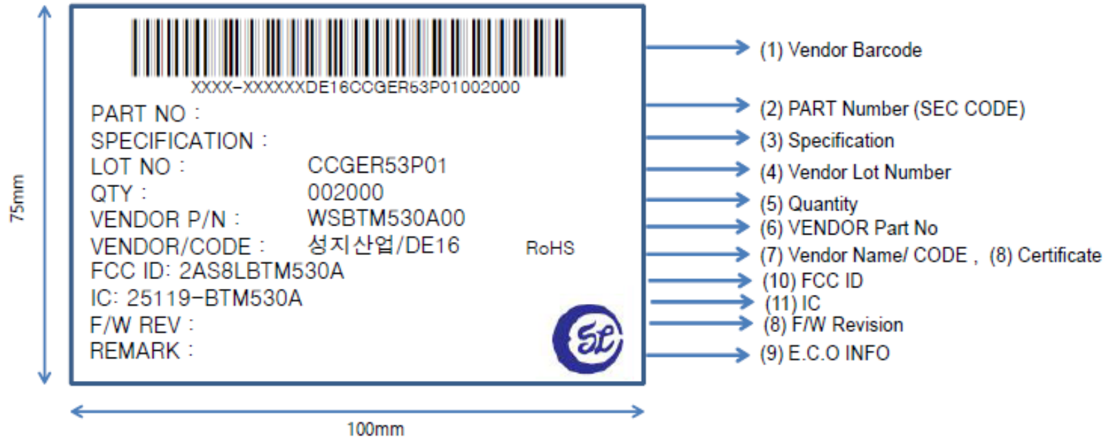
BTM530A_OUTBOX Label Design