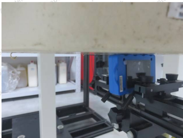
Left Side (0mm)