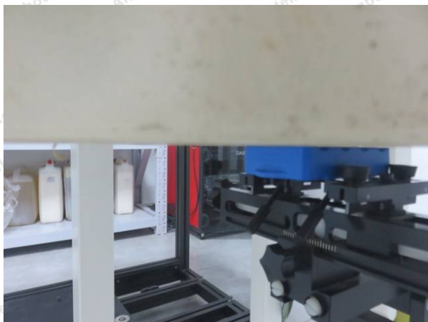
Front Side (0mm)