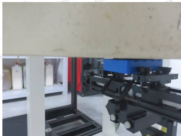
Rear Side (0mm)