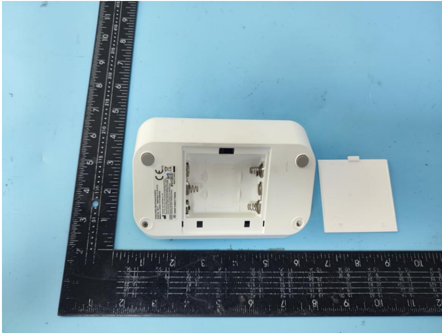
INTERNAL PHOTO OF SAMPLE