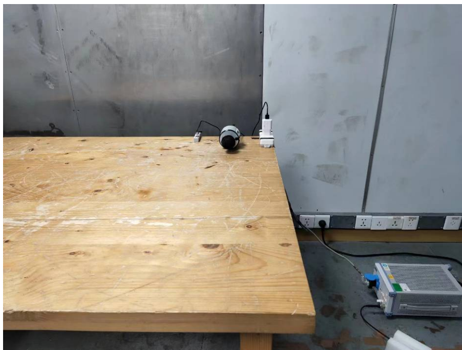
Photo of Conducted Emission Measurement