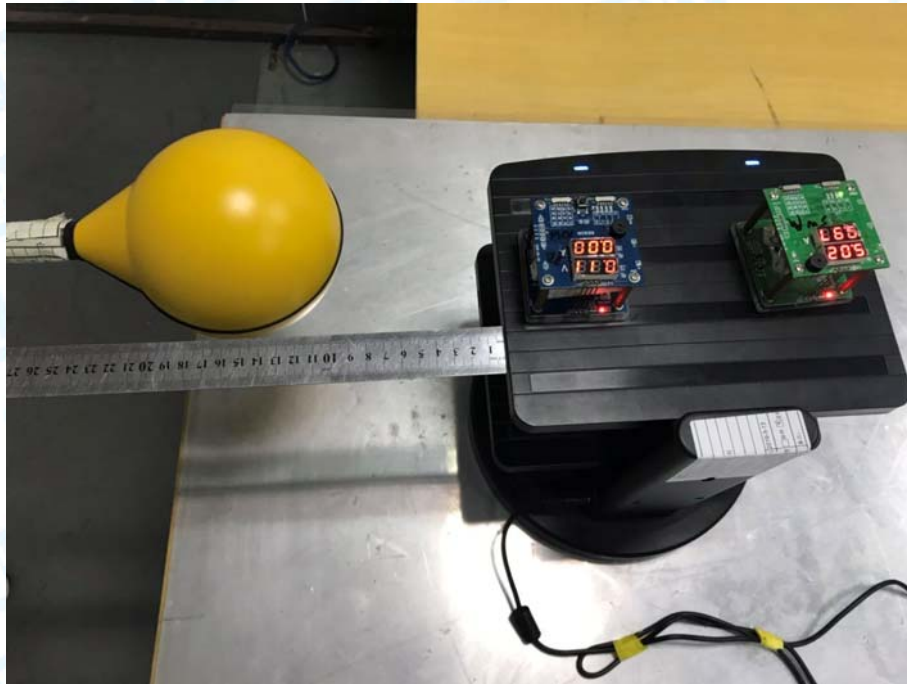
Test Set-up Photo