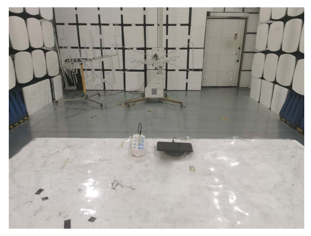
Radiated Emission below 1GHz-AC adapter charge mode