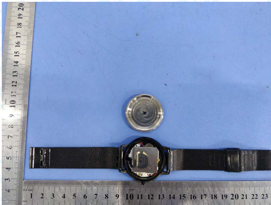
Photo 7 Internal of PCB