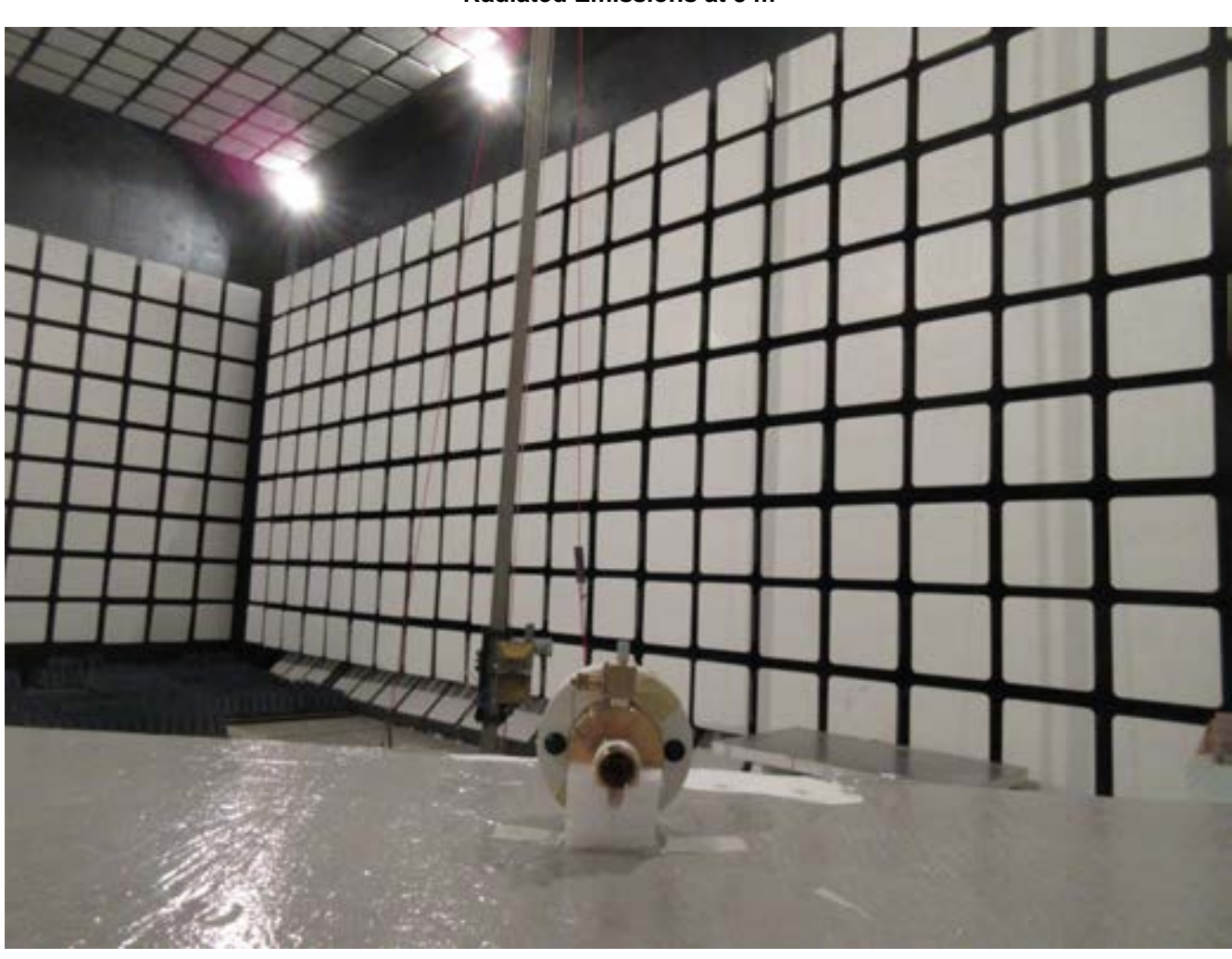
Radiated Emissions at 3 m