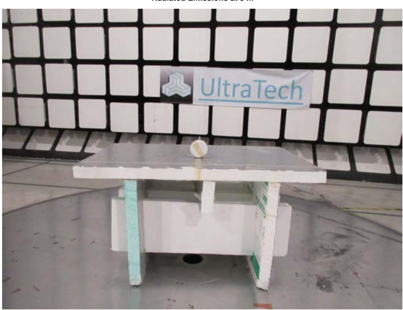
Radiated Emissions at 3 m