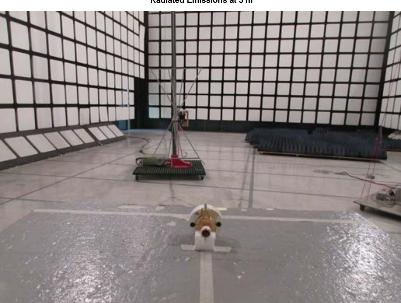
Radiated Emissions at 3 m