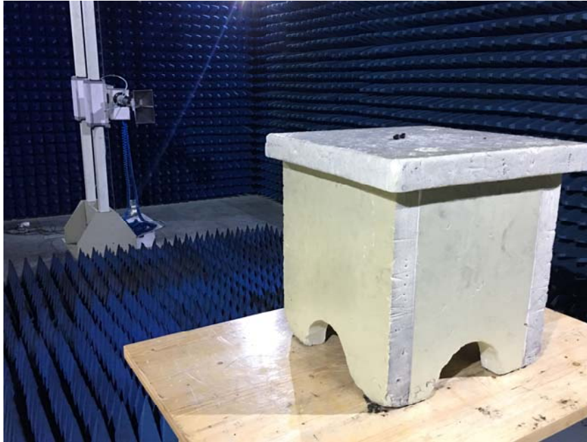
Photograph of set-up for conducted Emission