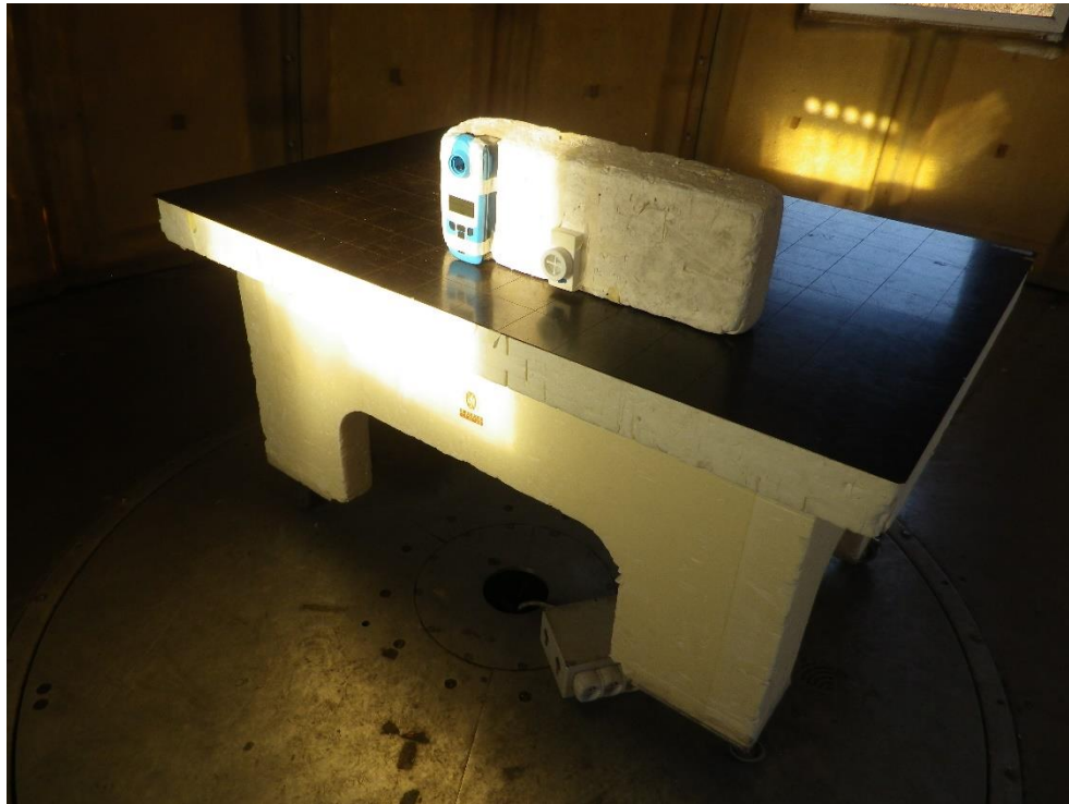
Test setup on OATS