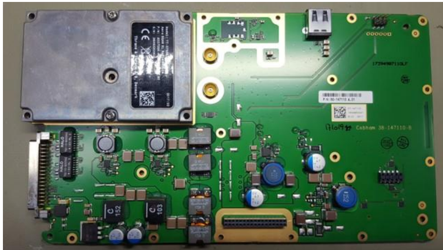
Figure 1: Modem Board (Top)