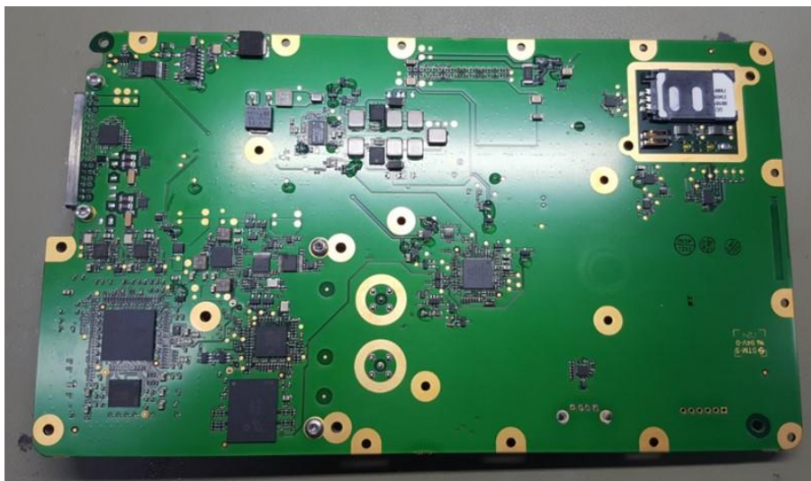
Figure 2: Modem Board (Bottom)