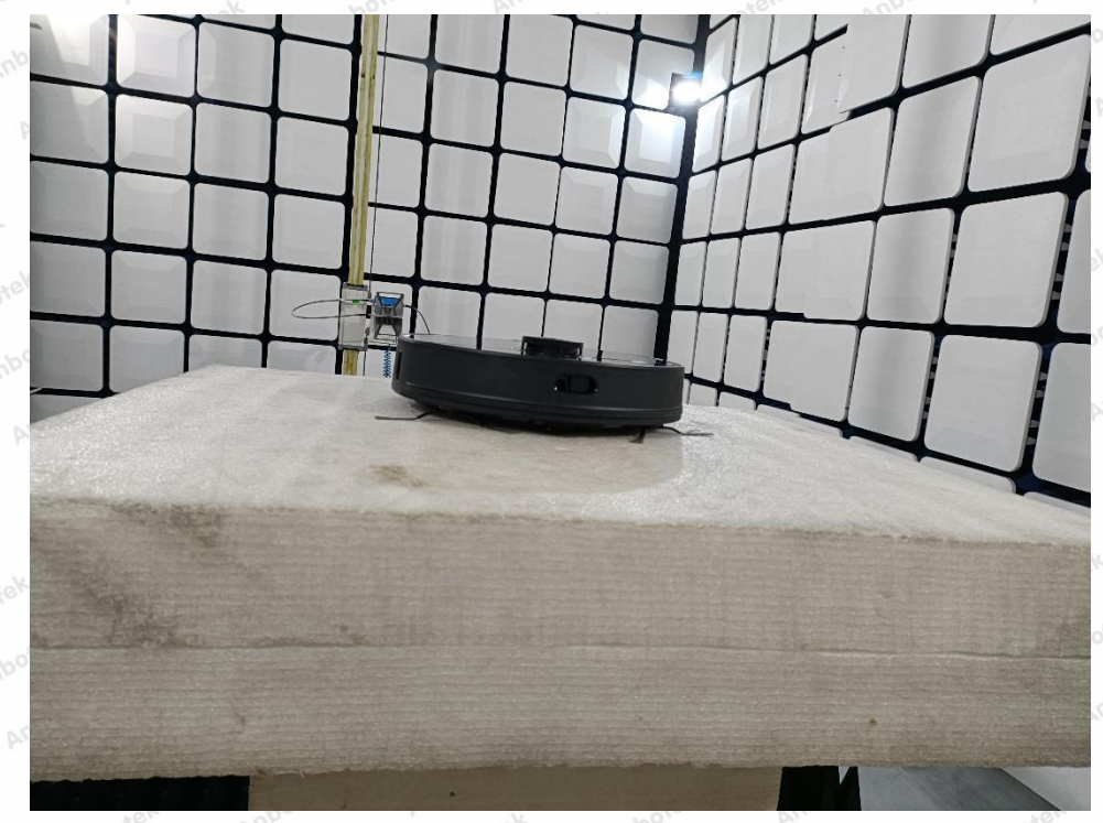
Page 2 of 2