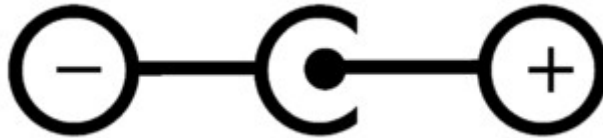
Drawing 1: Power Jack polarity

The WizziGatePro works on a 12V external power supply, model YNQX18