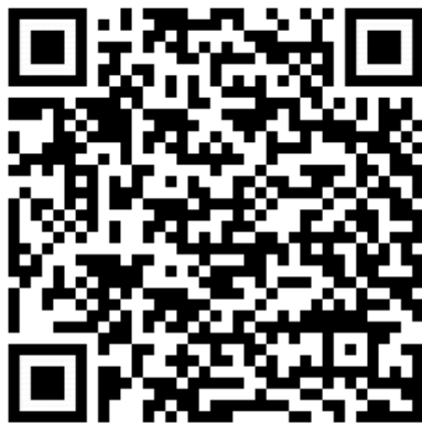
Google Play Store