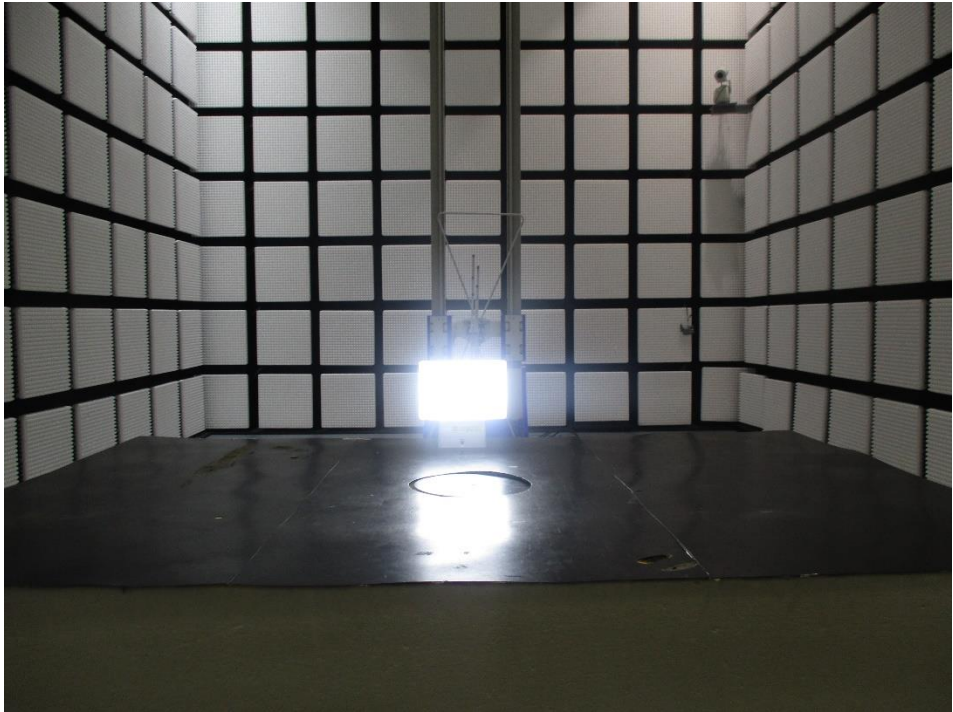
Radiated Emission test Above 1GHz