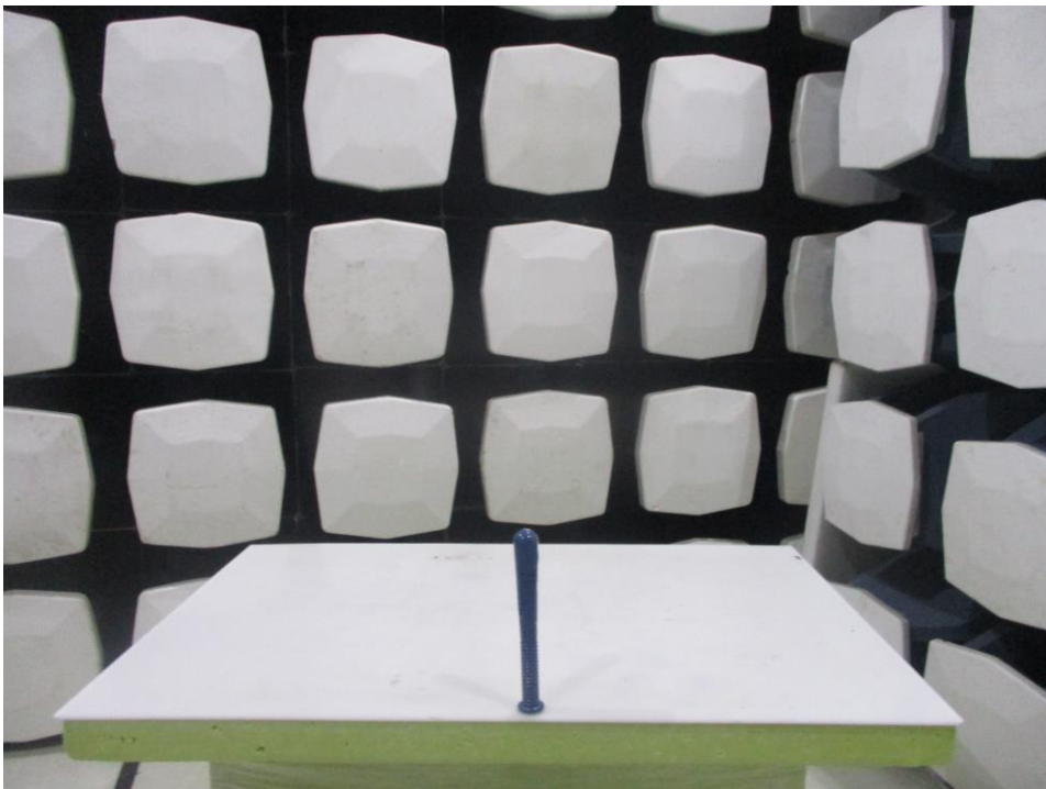
Up to 1GHz (EUT was placed in the centre of the turntable)