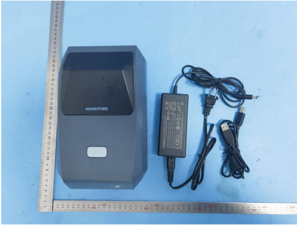
ADAPTER VIEW OF EUT