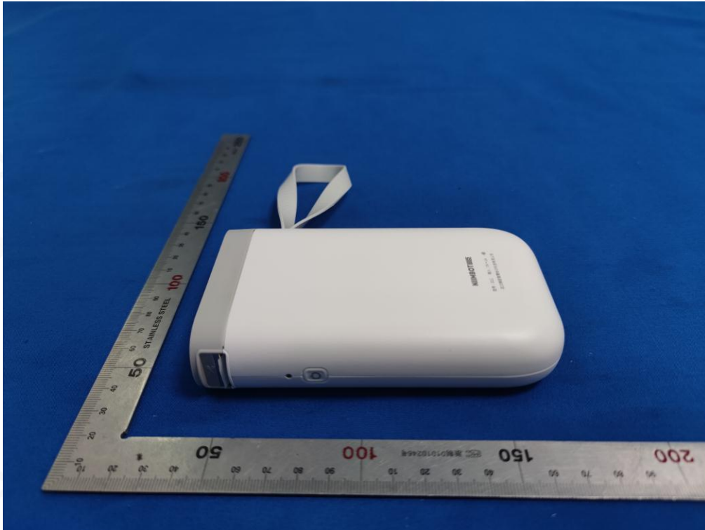
PORT VIEW OF EUT