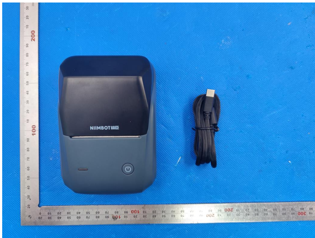
TOP VIEW OF EUT