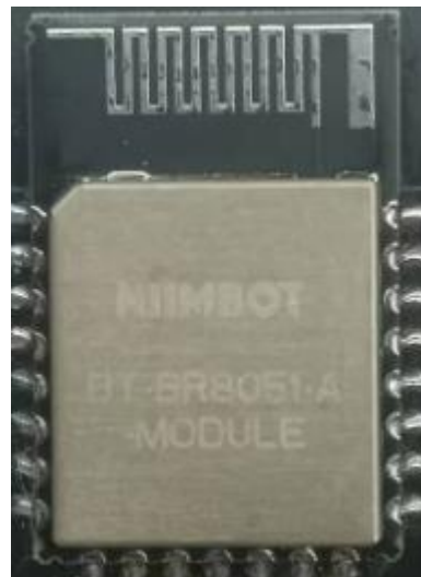
Figure 1: Module picture