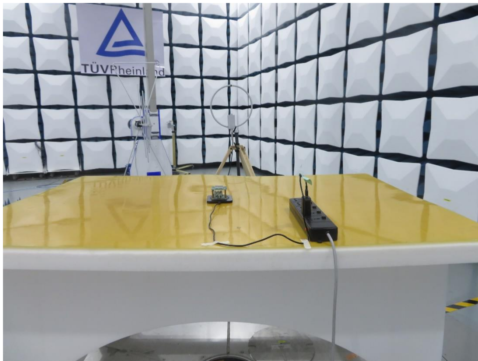
Photograph 2: Set-up photo for Radiated Spurious Emission, 30MHz - 1GHz