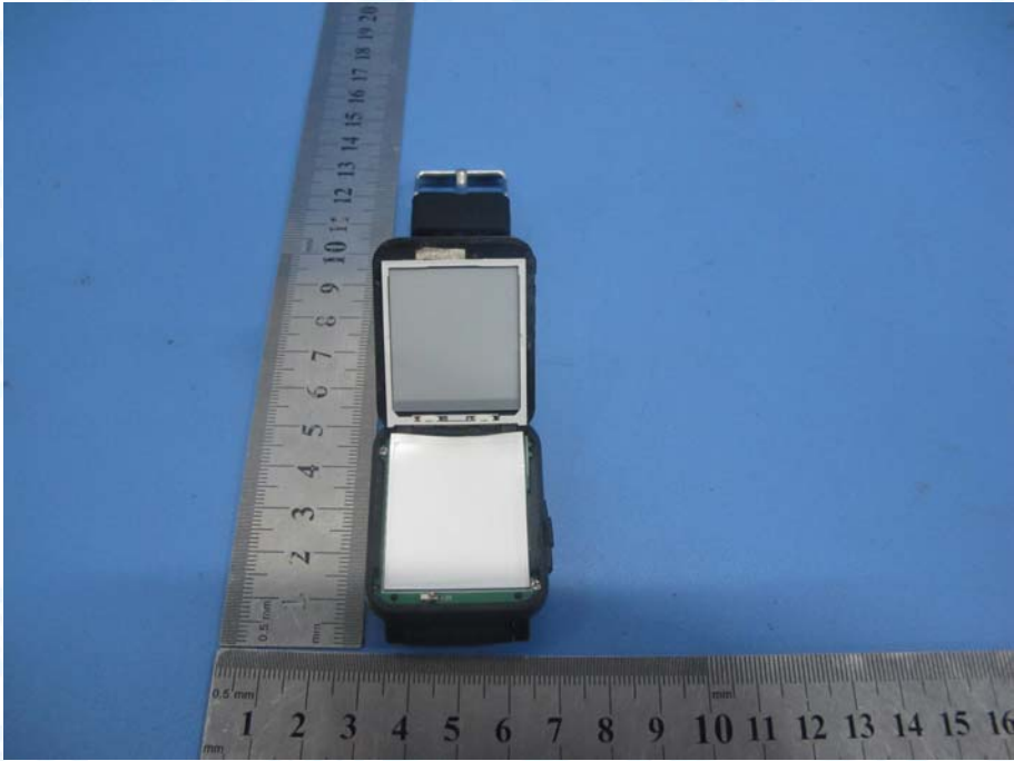
Photo 7 Appearance of PCB