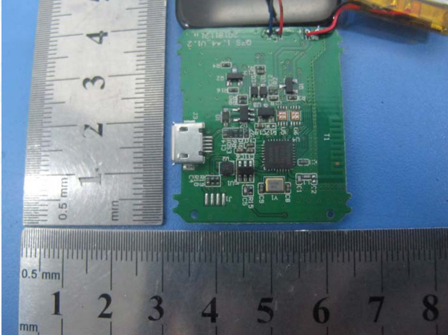
Photo 9 Appearance of PCB