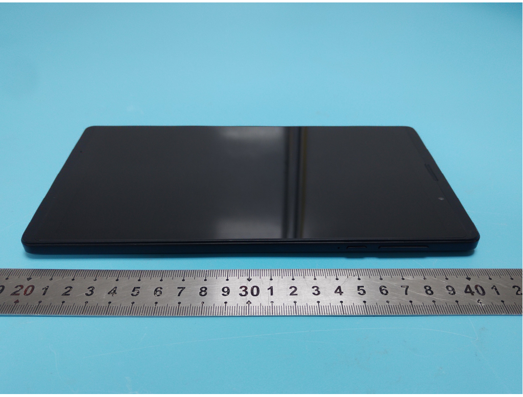
Page 4 of 5