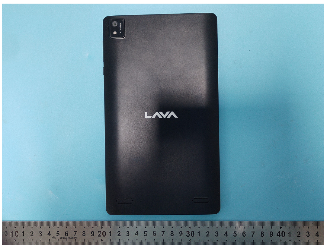
Page 2 of 5