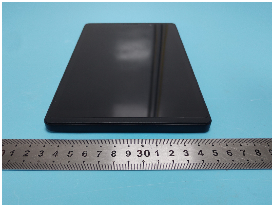
Page 3 of 5