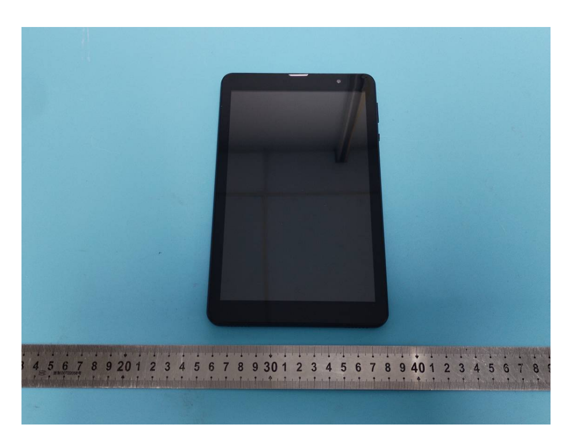
EXHIBIT B - EUT EXTERNAL PHOTOGRAPHS