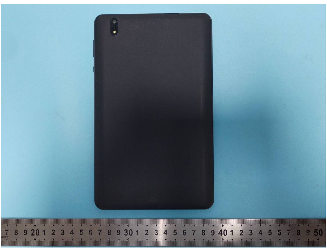
Page 1 of 3