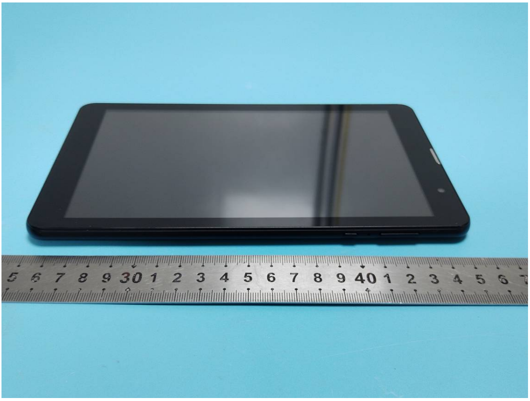
Page 3 of 3