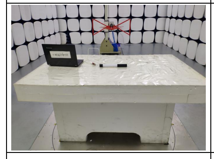
Radiated Spurious Emissions Test Setup Below 1GHz