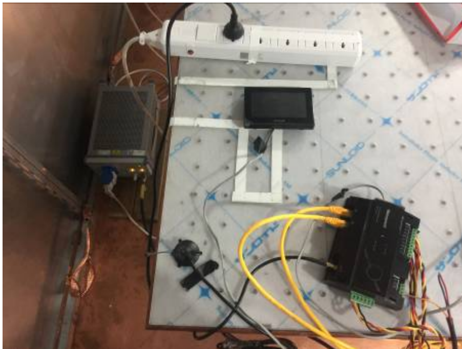
Conducted Emissions Test Setup (with charger)