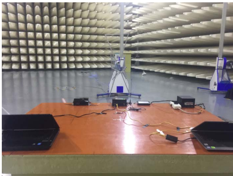
Spurious Radiated Emissions Test setup (30MHz~1GHz) 0.8m