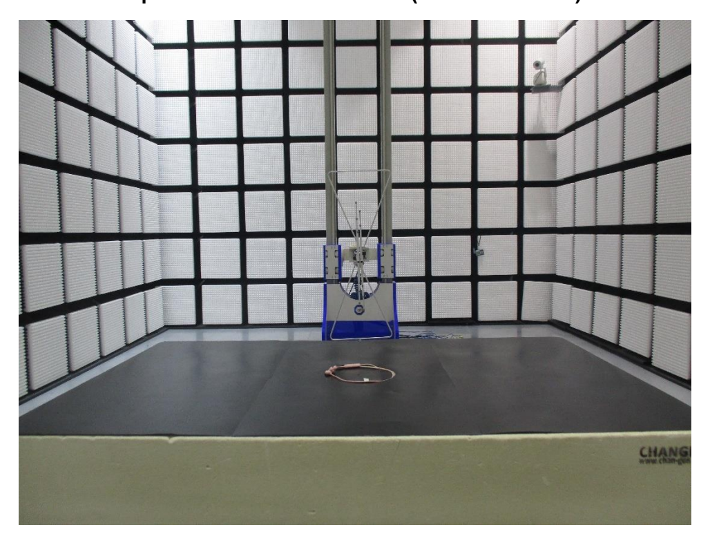
Spurious Emission (Above 1GHz)