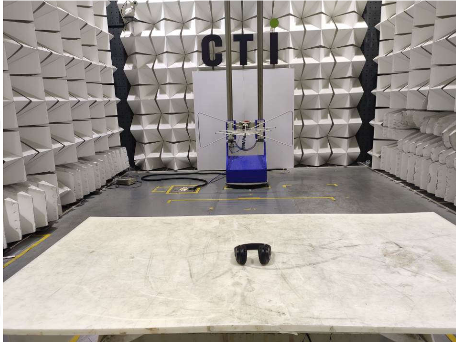
Radiated spurious emission Test Setup-1(Below 1GHz)