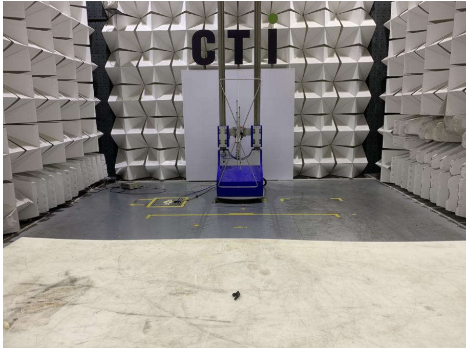
Radiated spurious emission Test Setup-1 right ear(Below 1GHz)