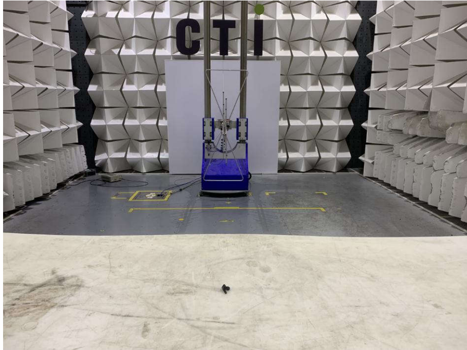
Radiated spurious emission Test Setup-1 left ear(Below 1GHz)