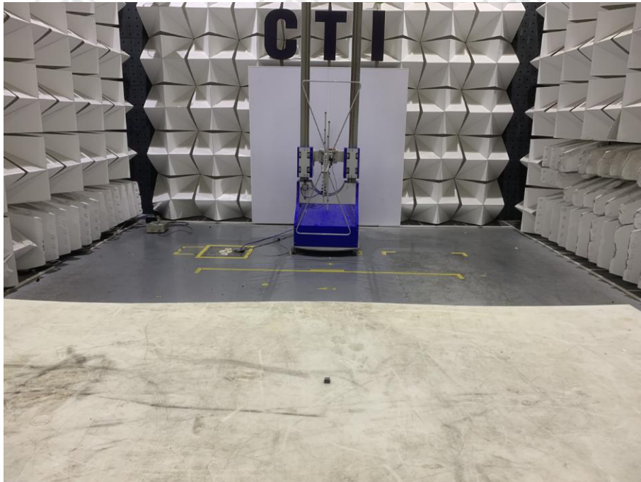
Radiated spurious emission Test Setup-1(Below 1GHz)