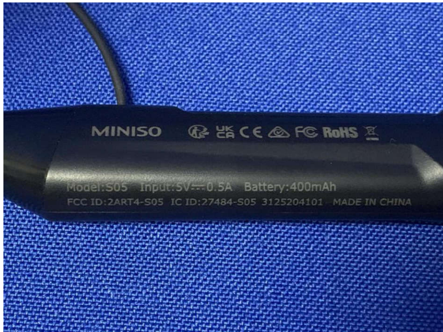
View of Product-10