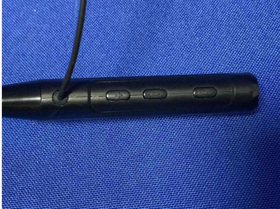
View of Product-9