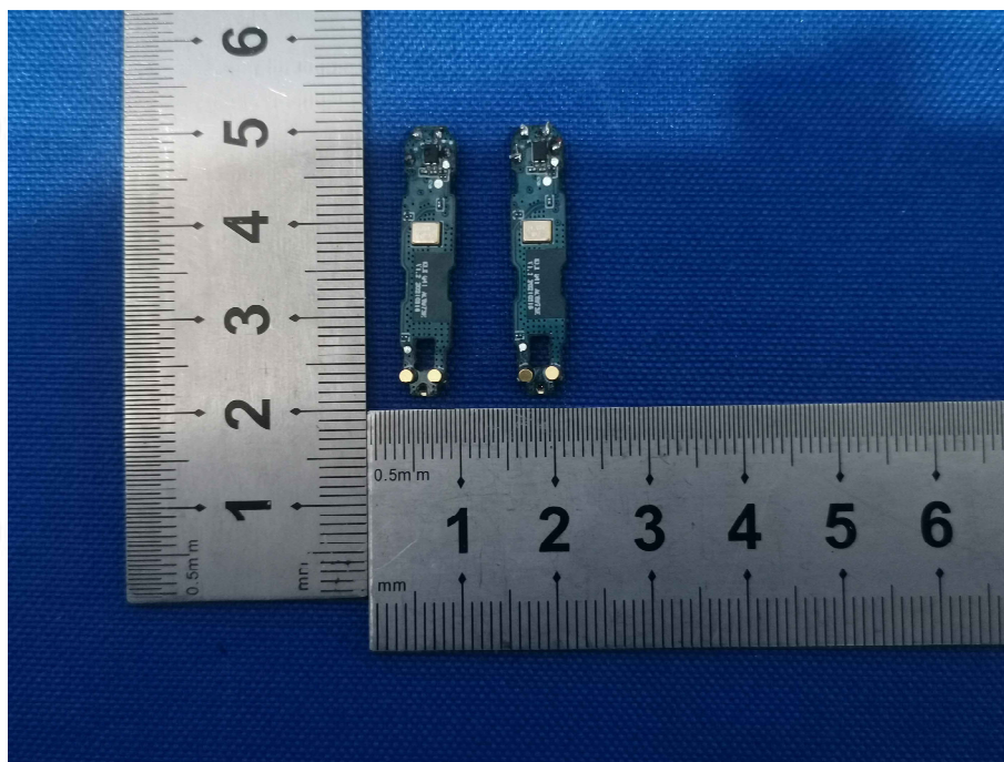
View of Product-17