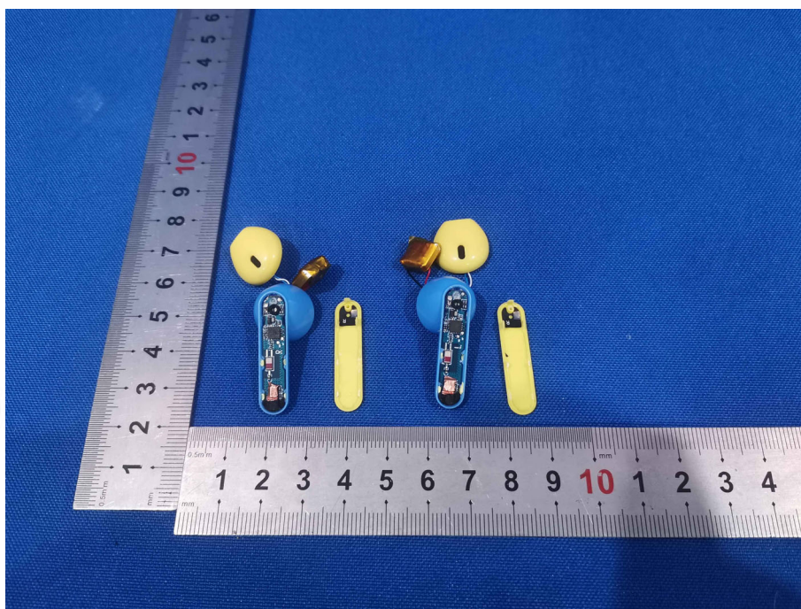
View of Product-14