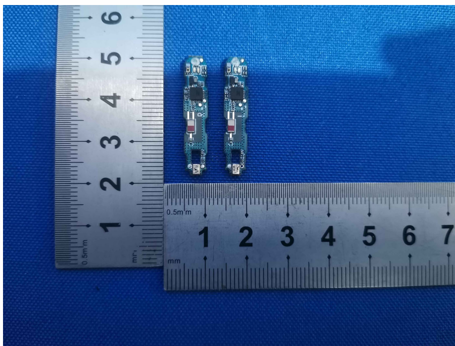
View of Product-16