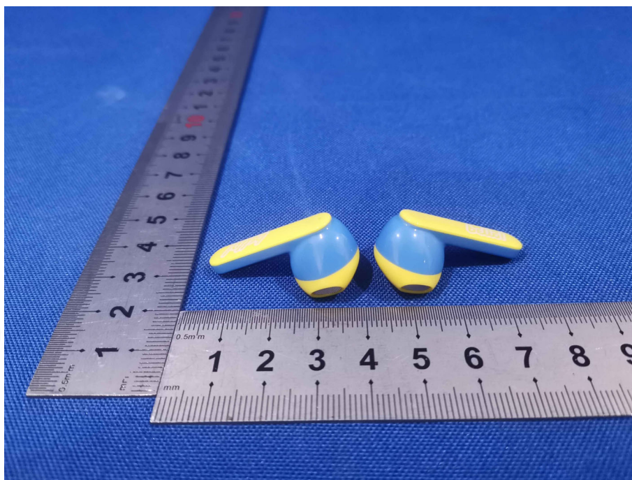
View of Product-13