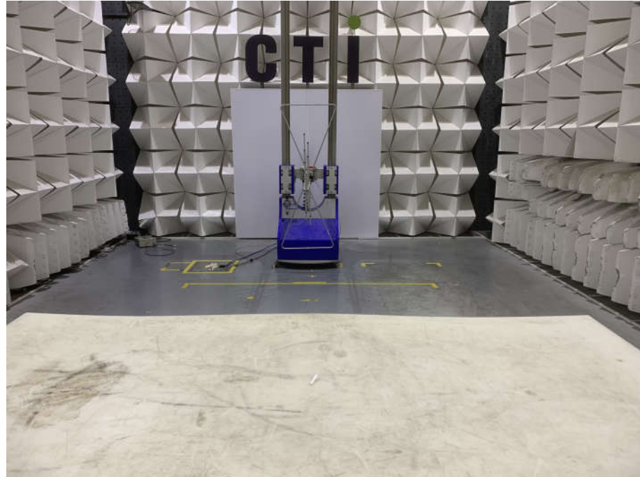
Radiated spurious emission Test Setup-1 right ear(Below 1GHz)