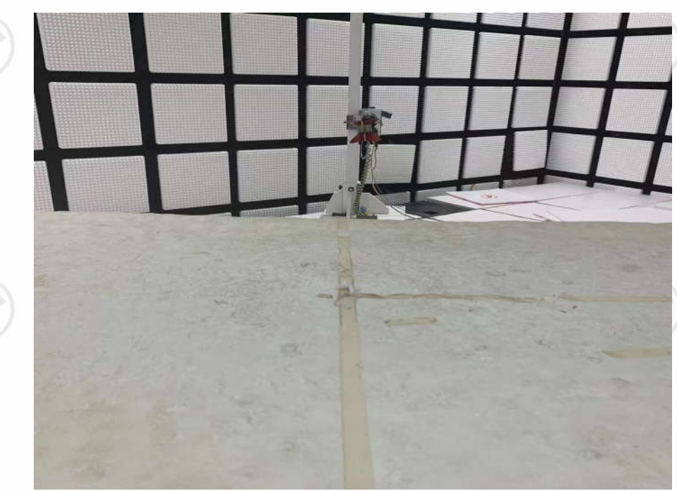
Radiated spurious emission Test Setup-2 right ear(Above 1GHz)