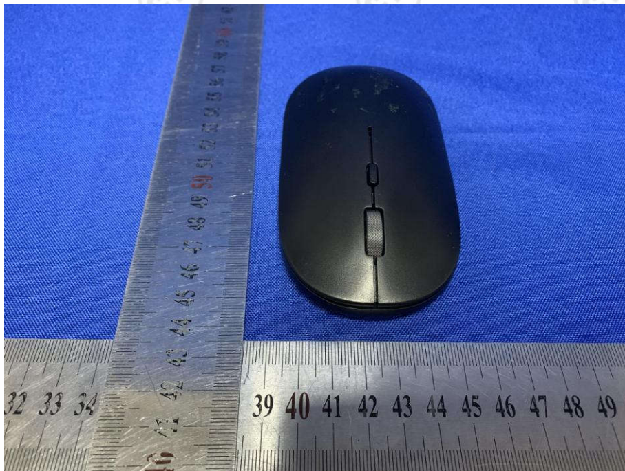
View of Product-4