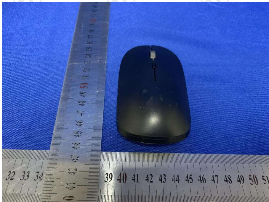
View of Product-2