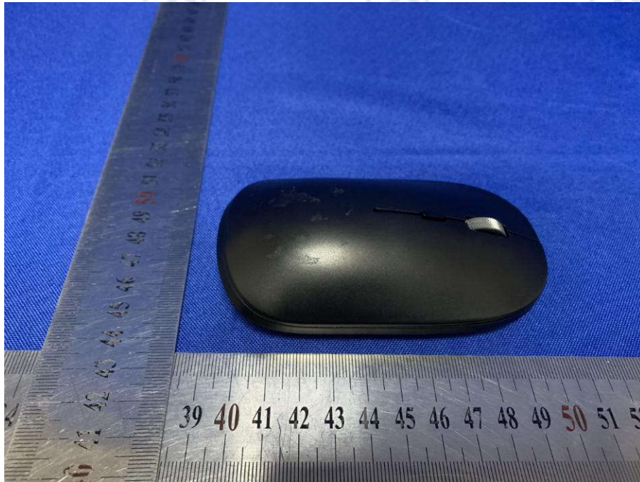
View of Product-3