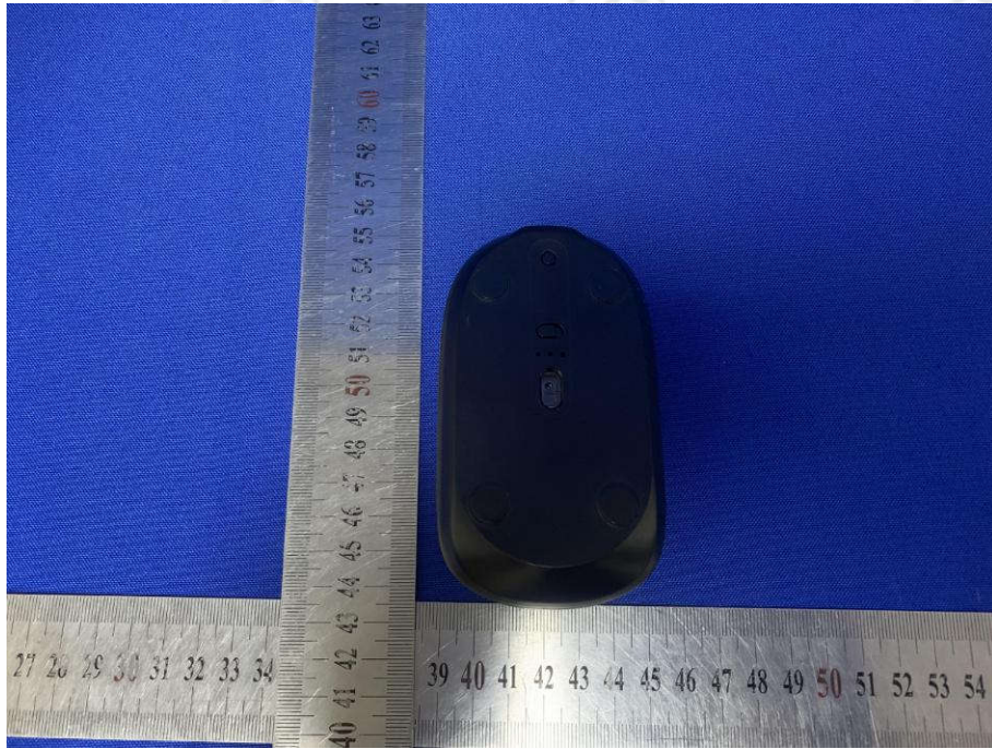
View of Product-5