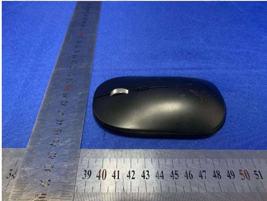
View of Product-1