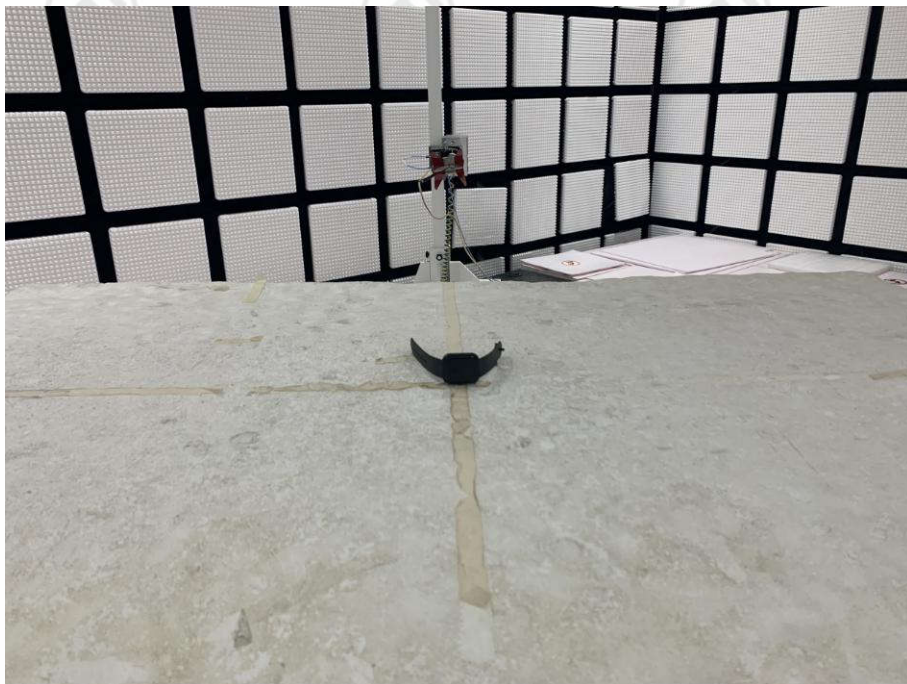
Radiated spurious emission Test Setup-2(Above 1GHz)