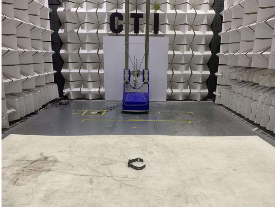
Radiated spurious emission Test Setup-1(Below 1GHz)