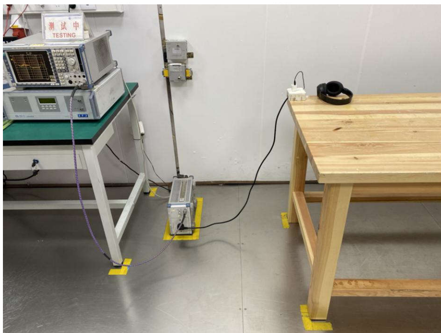
AC Power Line Conducted Emission